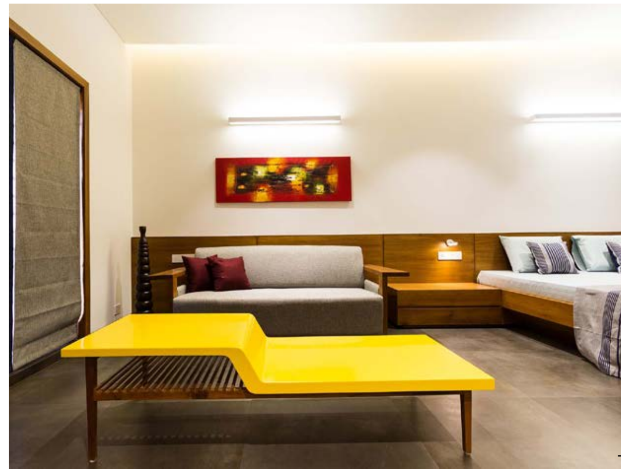
5 The minimalist master bedroom with its solid wood furniture. Shades of greens are added to give the room a more personalized touch.